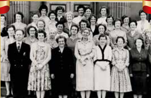
Accrington High School Staff 1970