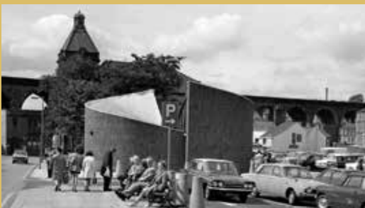
Union Street toilets 1970

A new monthly feature in Memory of Garth